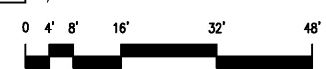
1 OVERALL PLAN - LEVEL 1 1/16"=1'-0"